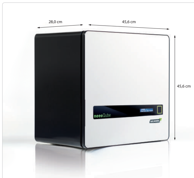
* According to our terms of guarantee, ** @ 80 % DoD