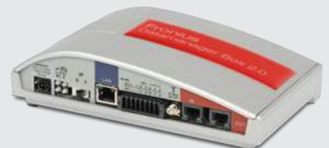
/ Fronius Datamanager Box 2.0